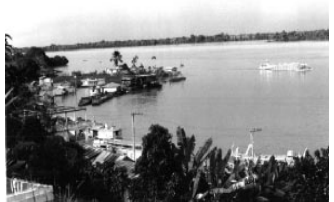
Santo Antônio is situated on the Amazon River. The "far" side is really islands.