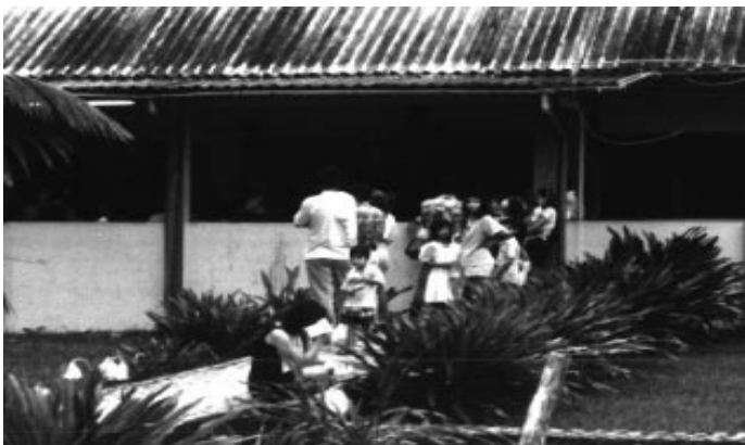
About 100 people arrived for each clinic day.