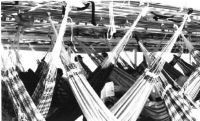
We traveled overnight by boat and slept in hammocks to get to the hospital.