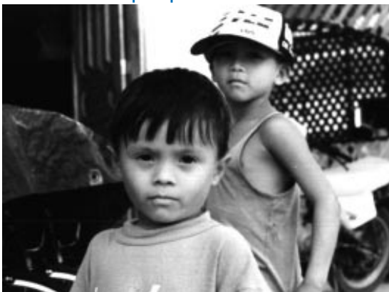
Children are everywhere.