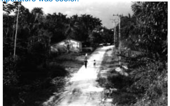
The road from town to the hospital (1/2 mile).