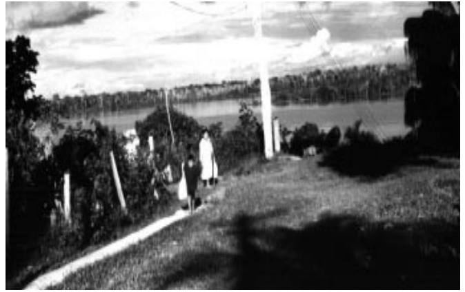
The view of the Amazon from our house.