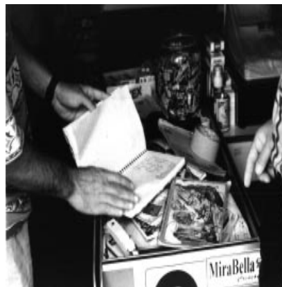
The "Books." There is no bank in Santo Antônio. A prosperous businessman in town exchanges money for everyone. He has a spiral notebook for each type of person...teachers, hospital workers, city workers, etc. He gives a good rate of exchange and has been known to cash over $30,000 in one month.