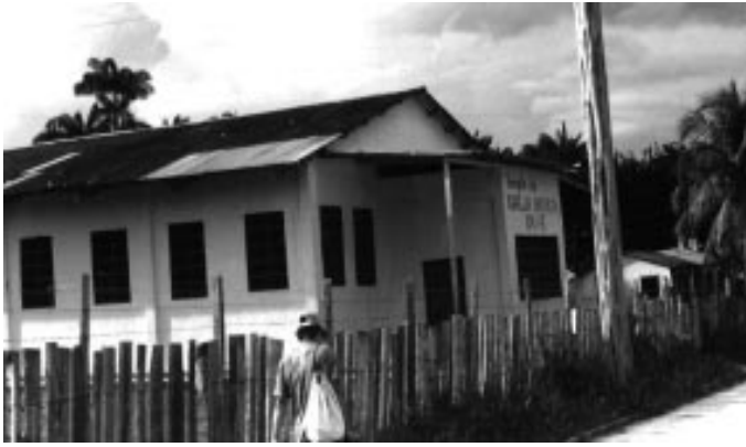
The Brazilian church we will attend in SAI.